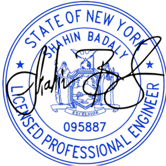
Shahin Badaly PE 095887